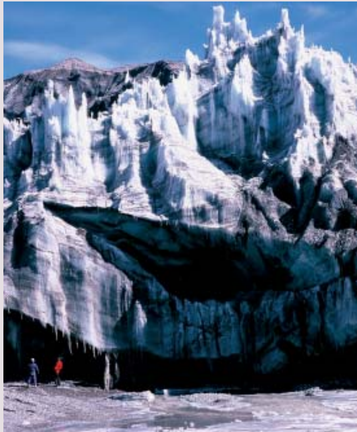
FIGURE 5 A huge ice cave in the Siachen Glacier—a striking visible reminder of the impact of global warming, another major anthropogenic source of risk.

The concept of a Transboundary Peace Park fits in completely with these suggestions, giving a positive dimension to the process. It would work not only toward disengagement but also toward the creation of a park to protect the environment—to allow the ibex, the snow leopard, and the wild roses to return. An informal group of the World Commission on