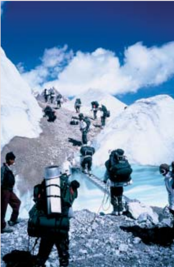
FIGURE 3 Indian army soldiers crossing a bridge on the Siachen Glacier.